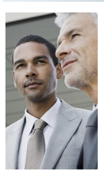
DELIVERING BREADTH AND DEPTH OF FUNCTIONALITY

JD Edwards EnterpriseOne solutions can help you integrate all aspects of your business—including customer relationship management, enterprise asset management, supply chain management, and supplier relationship management. Oracle also provides the business intelligence and performance management tools that help you measure the value that JD Edwards EnterpriseOne solutions deliver.